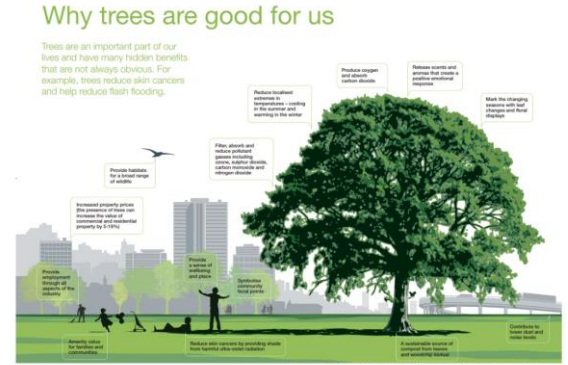
Produced by the London Tree Officer Association

We will have the knowledge, expertise and resources we need to deliver and plan for the future, and the passion to get us there. People, wildlife and our local economy will be thriving. This is a strategy for everyone in West Northamptonshire. It is about creating the safe, wildlife rich and resilient town, village and rural surroundings of our future.